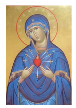
Our Lady of Sorrows, Pray for us!

Saint of the Day – St. Padre Pio of Pietrelcina September 23